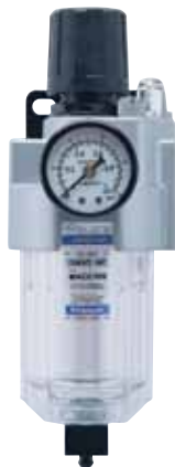
ALEMLUBE FILTER, REGULATOR, LUBRICATORS

The heavy duty adjustable spring assembly retrieves the 15m of 6mm ID rubber hose even when fully extended and the reel has a maximum working pressure of 300psi.