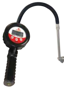
51114 DIGITAL TYRE GAUGE