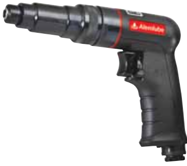
61164 1/4" PISTOL SCREWDRIVER