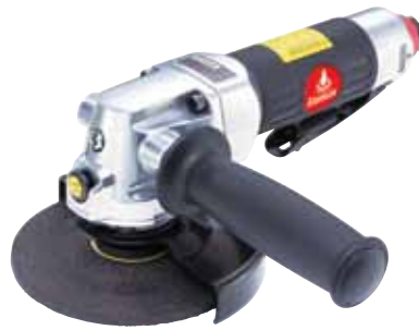
61174 4" DISC ANGLE GRINDER