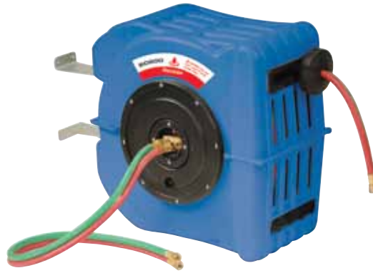
SO600 OXY ACETYLENE HOSE REEL